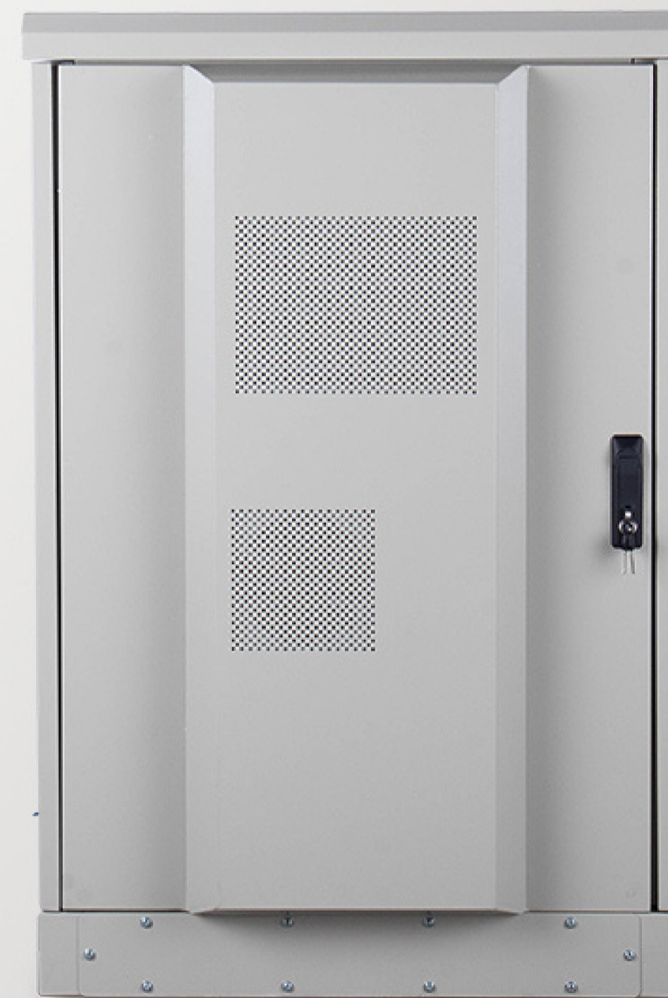
ODC STEEL AC 21 U