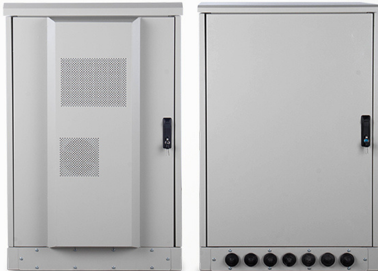
ODC STEEL 21U WITH AIR CONDITIONER