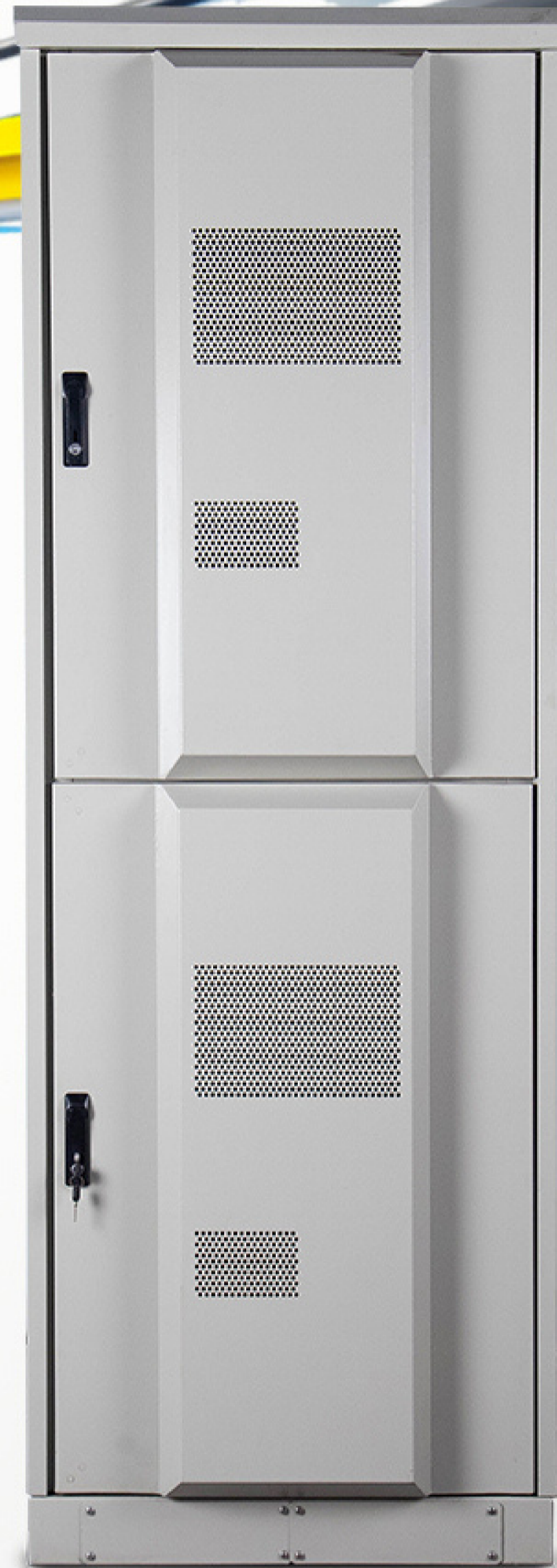
ODC STEEL AC 45 U